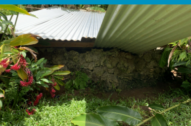
Elder Ian Family: 1x3,000 + 1 water tap