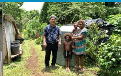
Mama Rose Family: 1x1000, 1 water tap