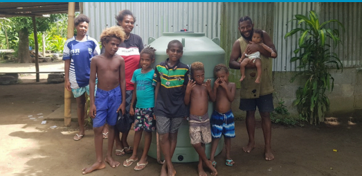
Bladinier (Church planting area)