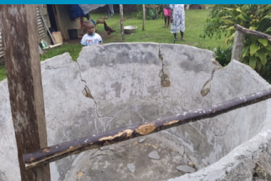
Mama Mary Family: 1x1000 + 1 water tap