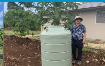
Nauratop Mission House: 1x1000 + 1 water tap